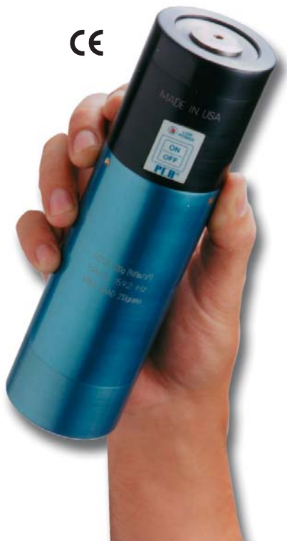
Model 394C06 Handheld Shaker Verifies Accelerometer and Vibration System Performance

Model 394C06 is a small, self-contained handheld shaker designed for the rapid checking of accelerometers, vibration monitoring systems, and recording systems. It provides a known, controlled, selectable RMS or peak vibration for verification of accelerometers weighing up to 210 grams.