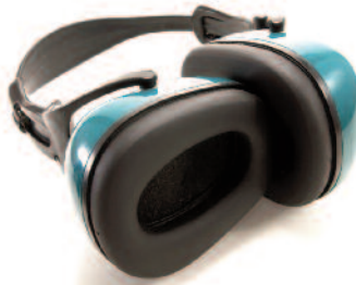
Test Lab Applications