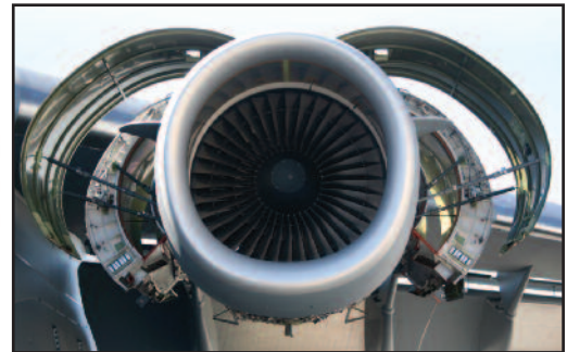
Aerospace & Defense Applications