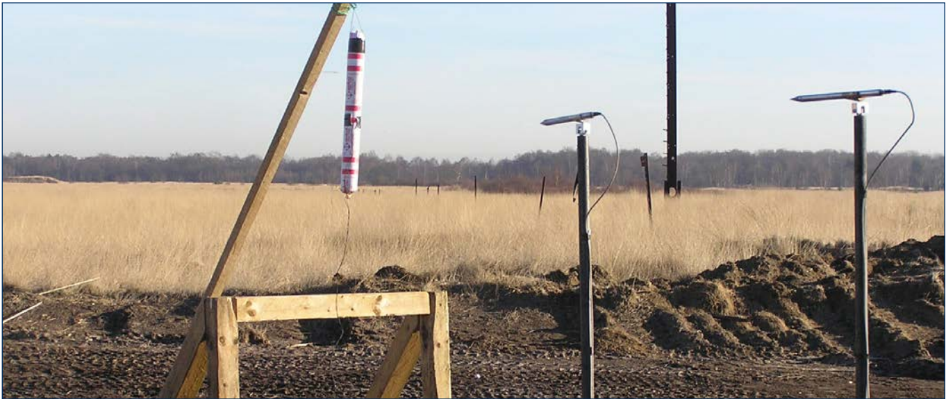
Photo 1: Pencil Probes are often mounted in multiple locations from the blast source.

Series 137B quartz, free-field, ICP® blast pressure probes have an unique pencil shape that allows the shock wave to progress smoothly across the sensor, providing distortion free measurements. Applications include measuring blast pressure to obtain peak pressure, total impulse, shock wave and time-of-arrival measurements often used to study blast effects.